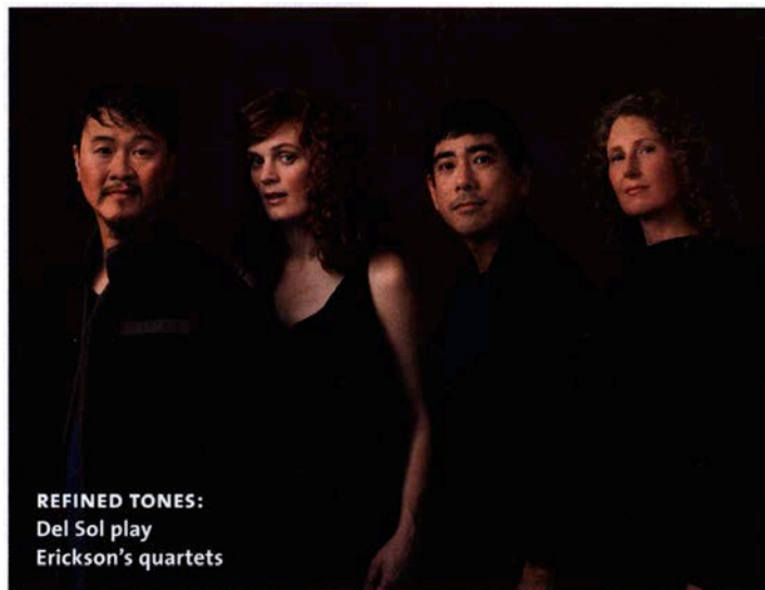
REFINED TONES: Del Sol play Erickson's quartets